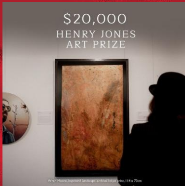
Featured work: Wren Moore, Imprinted Landscape , archival inkjet print, 2019.