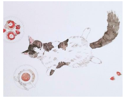
Rebekah Francis' playful cat ink and water colours will be on display in the Atrium Light Box throughout February.

This series focuses on the daily adventures of the domestic feline, through stories that have been shared with the artist about various cats. Capturing simple 'everyday' moments, Rebekah renders each scene in delicate watercolours, pen and washi tape. These small artworks are humorous and with a strong sense of familiarity and warmth. With new work being added daily, it will be worth multiple visits!