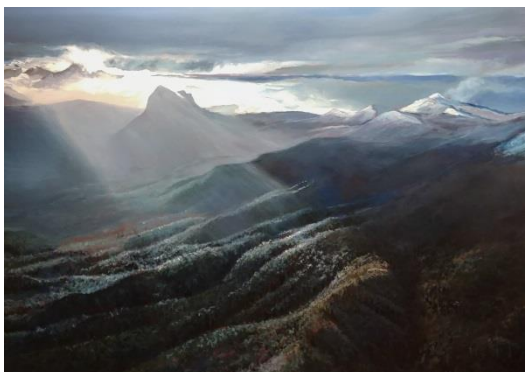
Angus Douglas, Precipitous Realm , 2019, acrylic on canvas, 167 x 200cm, location: Packing Room.