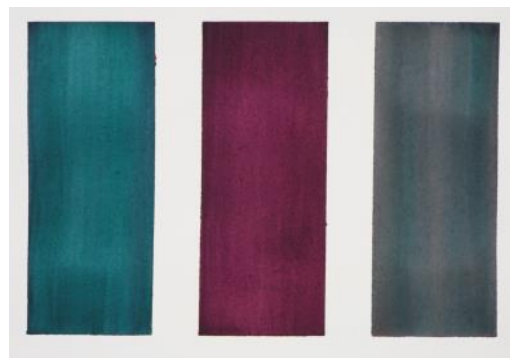
Catherine D'Orazio, Pooling , 2017, watercolour, 40 x 48cm, location: IXL Long Bar

Catherine's artworks are currently on display in the IXL Long Bar, so pop in, grab a drink and allow the colours to wash over you.