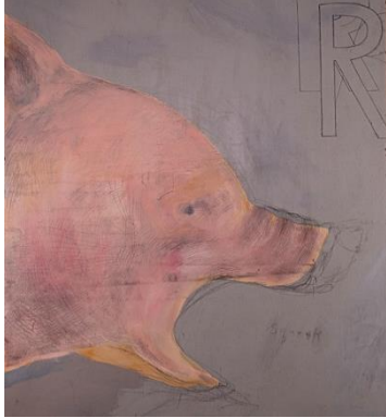
Reckoning Exhibition open daily, 10am – 5pm, from 13 th June.