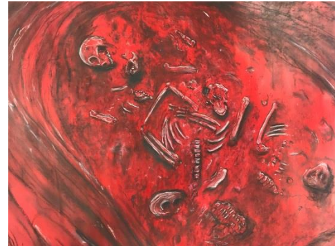
Paint the Town Red! Charcoal drawing by Peter Noakes.

Check out Peter's art in the Atrium Light box, located in the walkway between Jam Packed Café and IXL Long Bar.