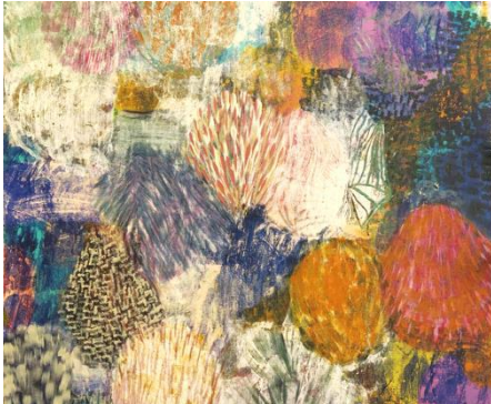
Julia Castiglioi-Bradshaw, Blue & Orange (cropped), 2019, acrylic on canvas, $4,800, located on 1 st floor.