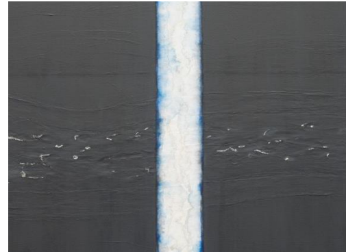
Untitled 1Blue , 2019, acrylic and kozo paper strip on canvas, $1,280, located in The Art Installation Suite.

Keven's delicate and contemplative artwork can be found in the Art Installation Suite.