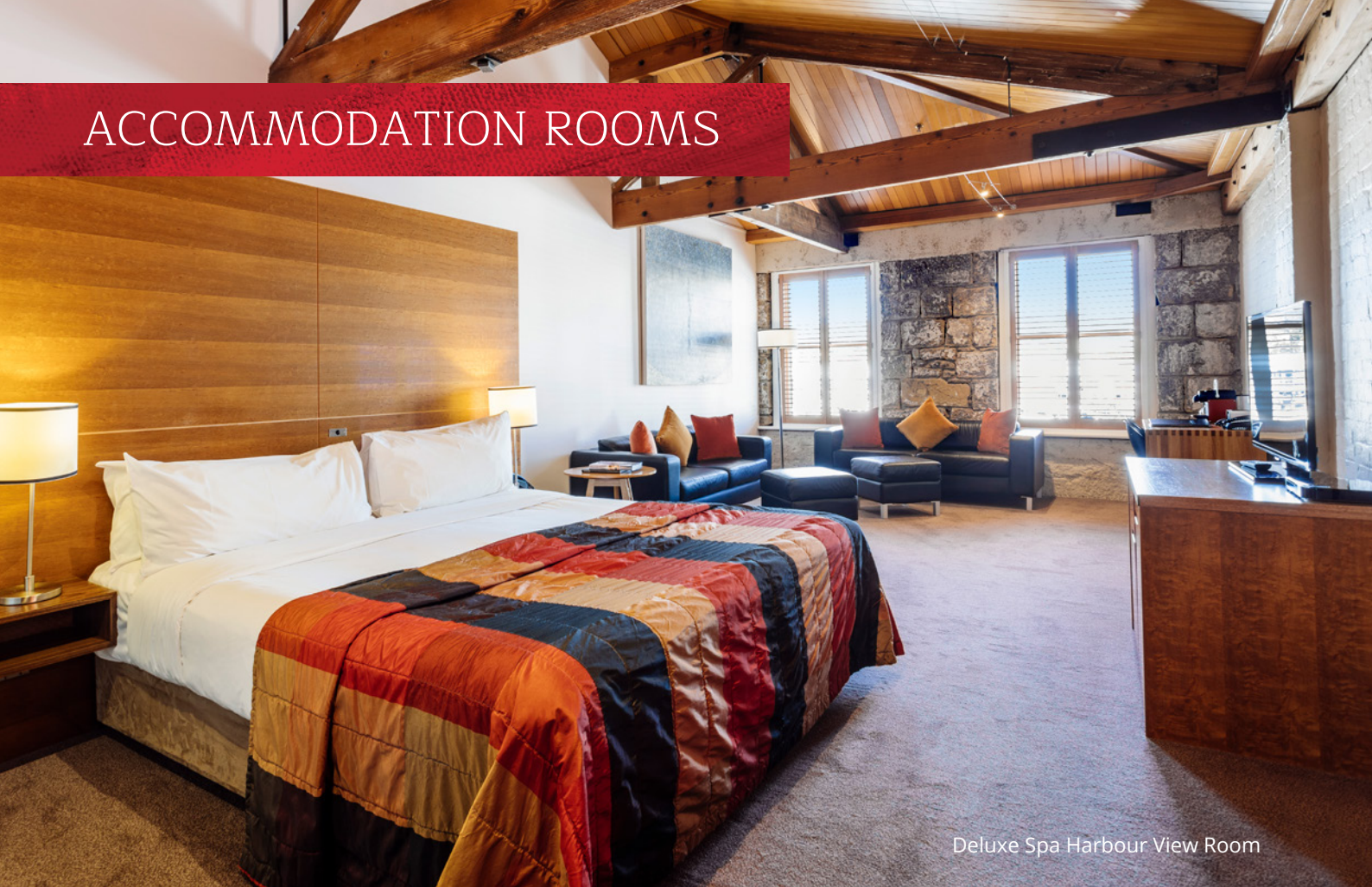
Deluxe Spa Harbour View Room

The Accommodation Rooms of The Henry Jones Art Hotel all have perfectly curated artworks within. The rooms have been built around the original IXL Jam Factory architecture, making each room unique with its own history. Art lovers have told us: the works all suit perfectly, and perfectly refine the Henry Jones Art Hotel experience.