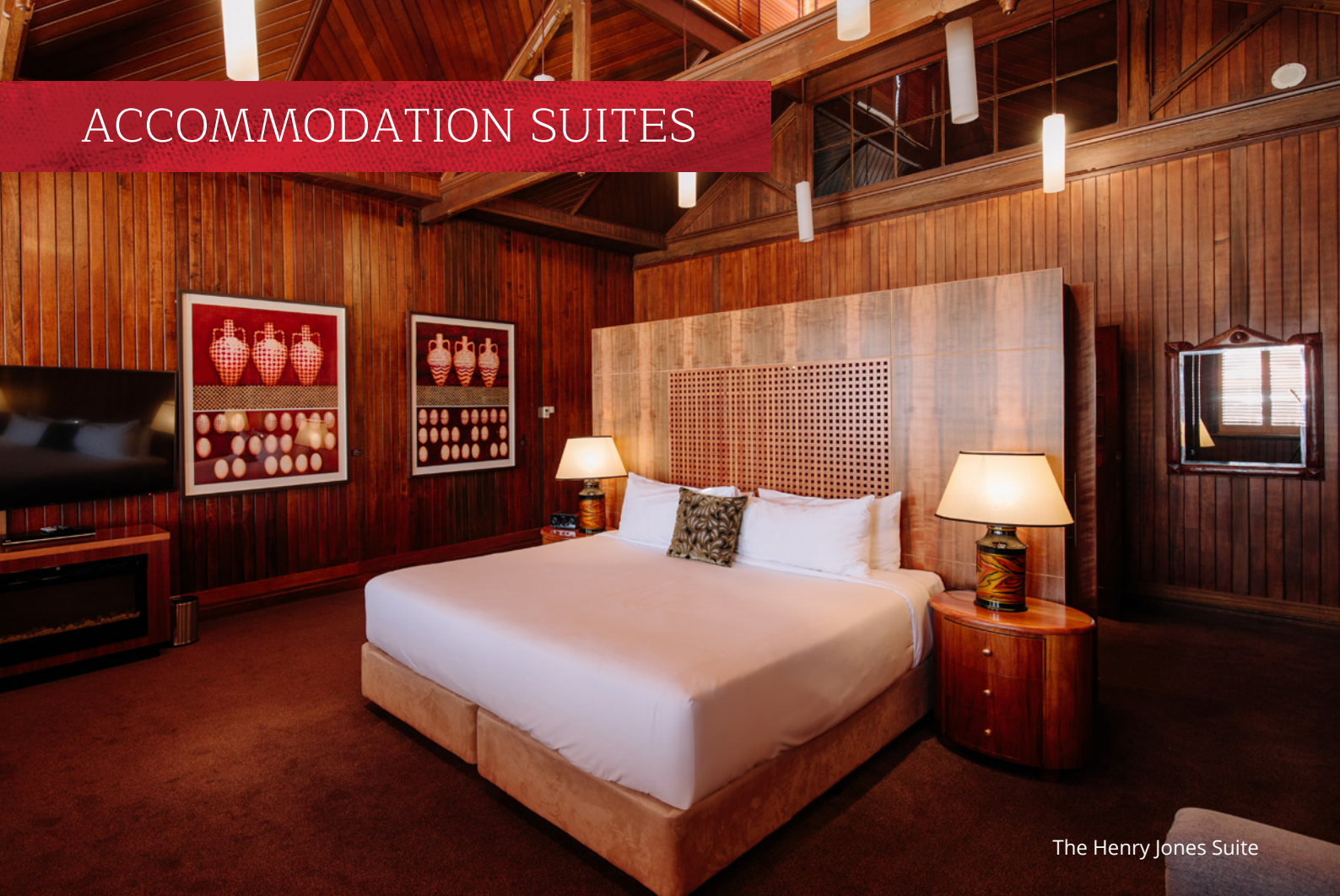
The Henry Jones Suite

The Henry Jones Art Hotel Suites are defined by history and unique beginnings, as well as their luxury inclusions, like extra space, living areas, and Kohler infinity baths.